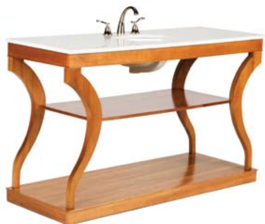
A compact yet fully functional wet bar with open storage area.