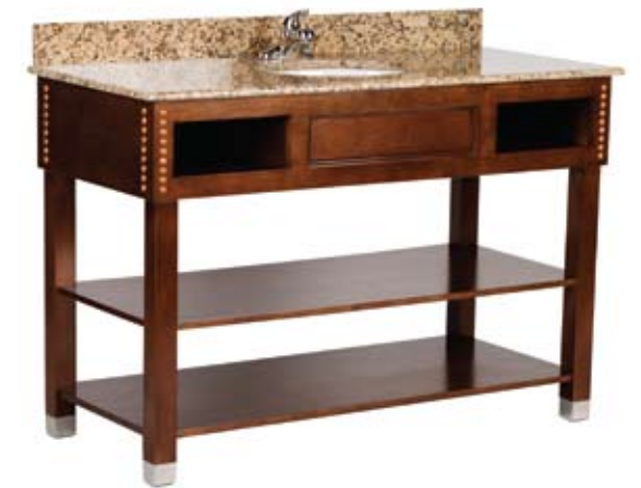
A tailored look in a freestanding base with capacious tiered shelves.

ProjectStone produces custom wood furniture for every hospitality market segment in North America, from economy motels and suites to high-end hotels and resorts, as well as a growing list of international clients. We also have a network of sales associates in 17 locations throughout the U.S. to ensure prompt, knowledgeable assistance close to where you are.