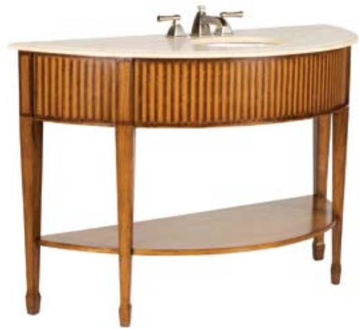
Engineered for daily use and long-lasting beauty.