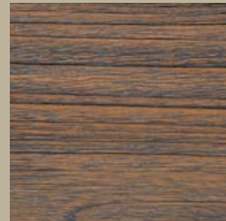
Grey Wash Teak