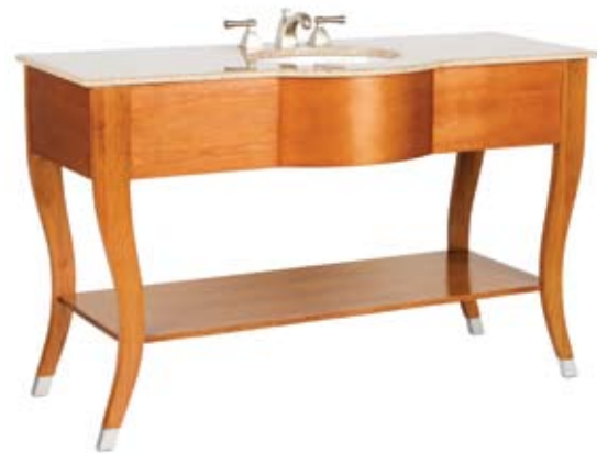
Graceful lines in a freestanding base with two ample storage shelves.