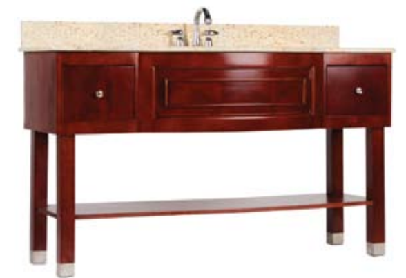
Elegant bowed front adds a touch of luxury in a wall-mounted design.