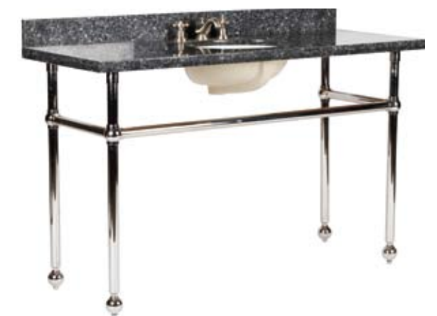
Streamlined wall mounted design provides easy-to-reach storage.